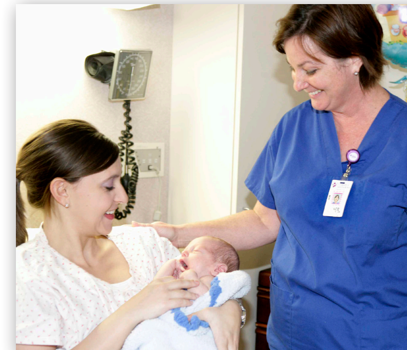
CSRH - WH delivers approximately 150 newborns each month.

ASSOCIATE GIVING FUNDS WIRELESS FETAL MONITORS