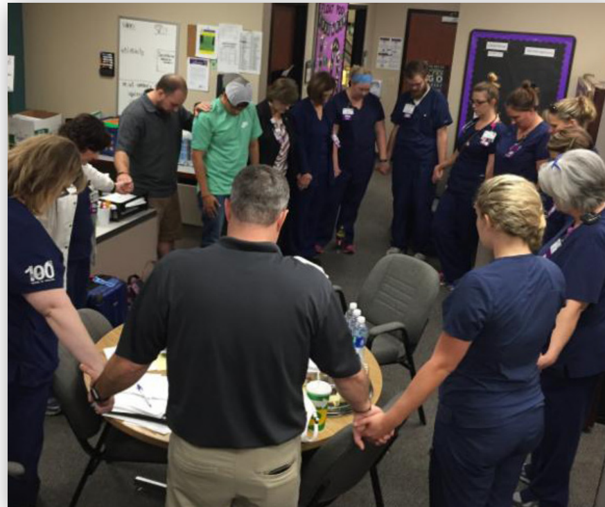
Associates from CHRISTUS St. Michael pray together before leaving to San Antonio to help care for Hurricane Harvey patients.