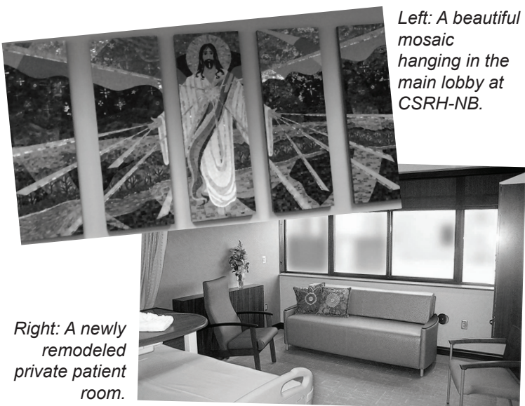
Left: A beautiful mosaic hanging in the main lobby at CSRH-NB.

The environment of care at CHRISTUS Santa Rosa Hospital – New Braunfels (CSRH-NB) has been carefully planned and executed with the comfort and safety of patients and their families in mind. The hospital recently underwent an extensive 12-month renovation with the goal of creating a homelike, modern facility, with private rooms. Non-slip, non-glare vinyl rubber floors were installed throughout the patient rooms, public areas and hallways to help prevent falls and control noise levels. The furniture is designed for infection control, but is also comfortable and functional for family members.