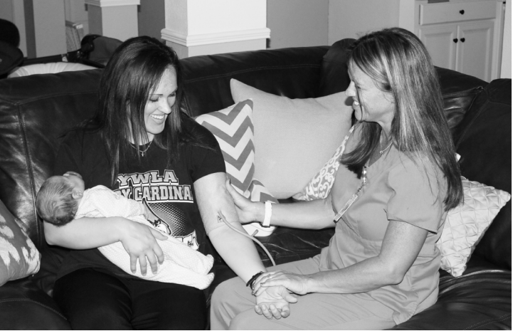
The EBMM program currently serves nearly 400 patients annually.

The Friends Foundation has been essential in providing funds in support of the Every Baby Matters Mission (EBMM) at CSRH - New Braunfels. The program allows new mothers the opportunity for inhome visits by a registered nurse following delivery. The nurse provides educational information on maternal and child health issues and child development, as well as a medical follow-up for mother and baby. The EBMM program is a free service available to high-risk parents, ranging from teen mothers with pre-term babies to those with feeding or social issues.