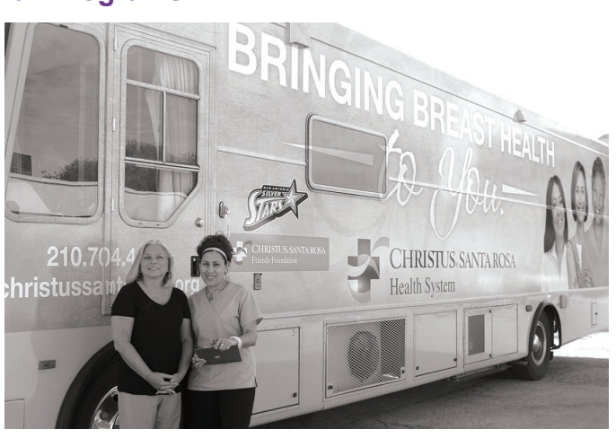
Since 2013, the number of mammograms provided by the MMU has doubled from 1,900 to 3,800 annually.

The Friends Foundation is an active partner in the mission to bring life-saving screening mammograms to underserved women in our community, funding renovations and equipment upgrades for the CHRISTUS Santa Rosa Mobile Mammography Unit (MMU). The MMU travels across Bexar County and 13 surrounding counties to more than 30 communities and provides free mammograms to women without insurance or the ability to pay. More than 1,000 of the screenings provided by the MMU each year are unfunded and must be covered by funds raised through grants and donations.