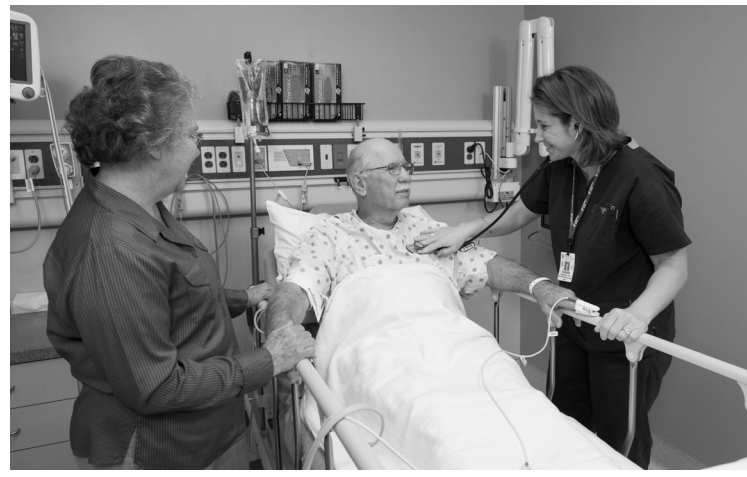
An estimated 12,000 seniors visit the Emergency Department at CSRH - Medical Center annually.

Thanks to funding from donors, CSRH - Medical Center, which has built a reputation for providing topnotch care for the elderly, has renovated and enhanced the healing environment in the Acute Care for the Elderly Center and the Orthopedics and Neurosciences Center. Special upgrades include non-slip, vinyl wood flooring, pressure-relieving mattresses, bed alarms and built-in weight scales. The hospital recently earned the NICHE (Nurses Improving Care for Healthsystem Elders) designation, which signifies its dedication to